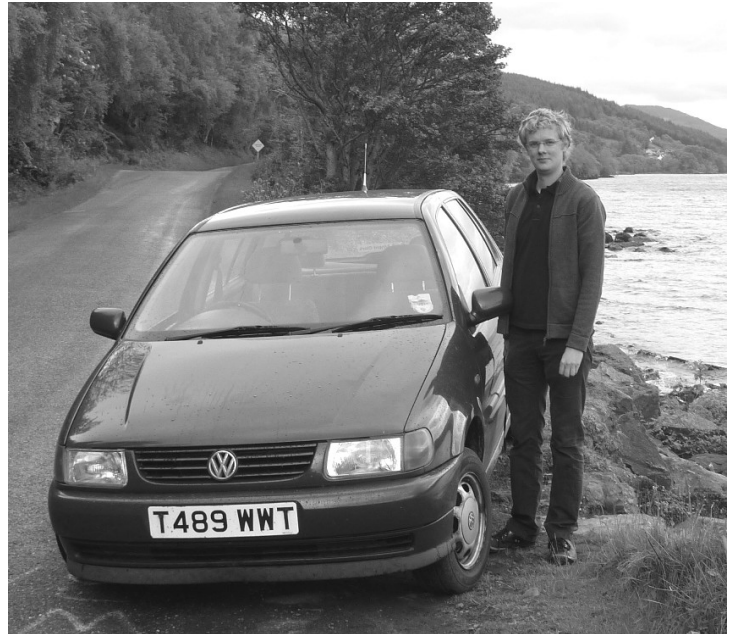
Thanks to Kennys Auto Repairs and Servicing in Inverness for their support in preparing the car for the event for free