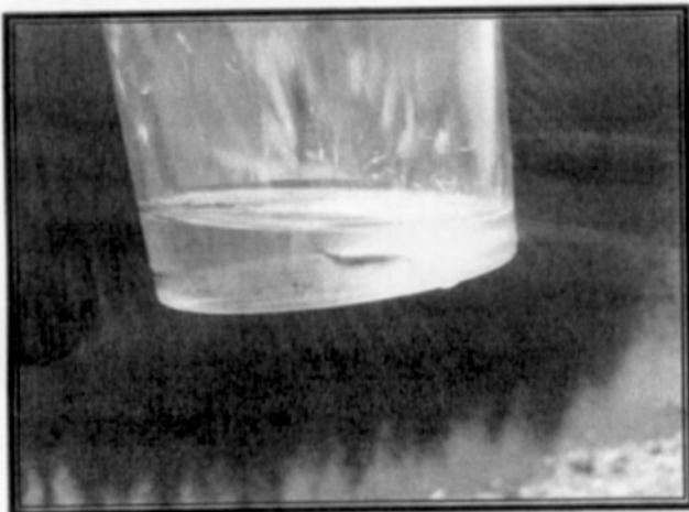
This was a Beetle Larvae