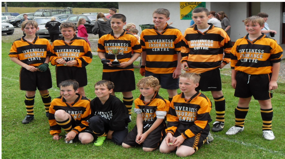
Boleskine under 14 June 09

The Boleskine juvenile teams of U12 and U14 level have been playing regularly in local competitions. The U14 have several matches as they are in a league along with Kingussie and Newtonmore and also in the Development Trophy along with Strathglass, Inverness, Tomatin and Glenurquhart. The youngsters have given a good display in these games against more experienced players as we have several primary age players in our team.