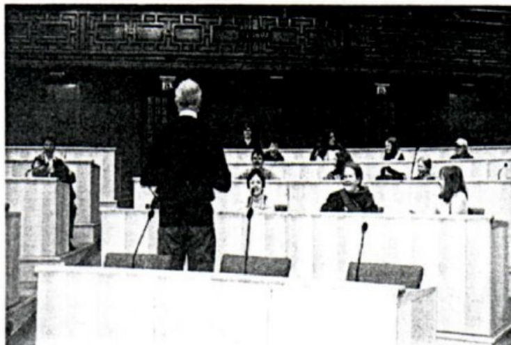
A member of staff at the Scottish Parliament explains the rules and procedures governing the work of our MSP's at Holyrood.

They visited the Scottish Parliament at Holyrood to find that all the MSP's and the Cabinet were not in session. So the children had fore-taste of citizenship education—beginning at the very top!